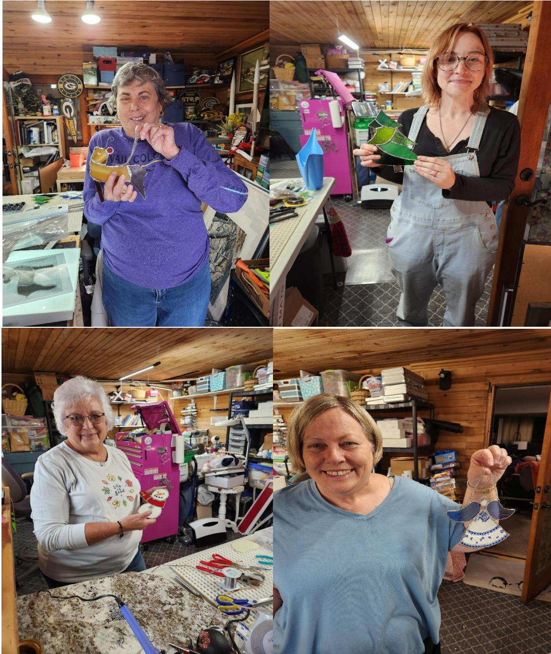
Cut Glass Workshop