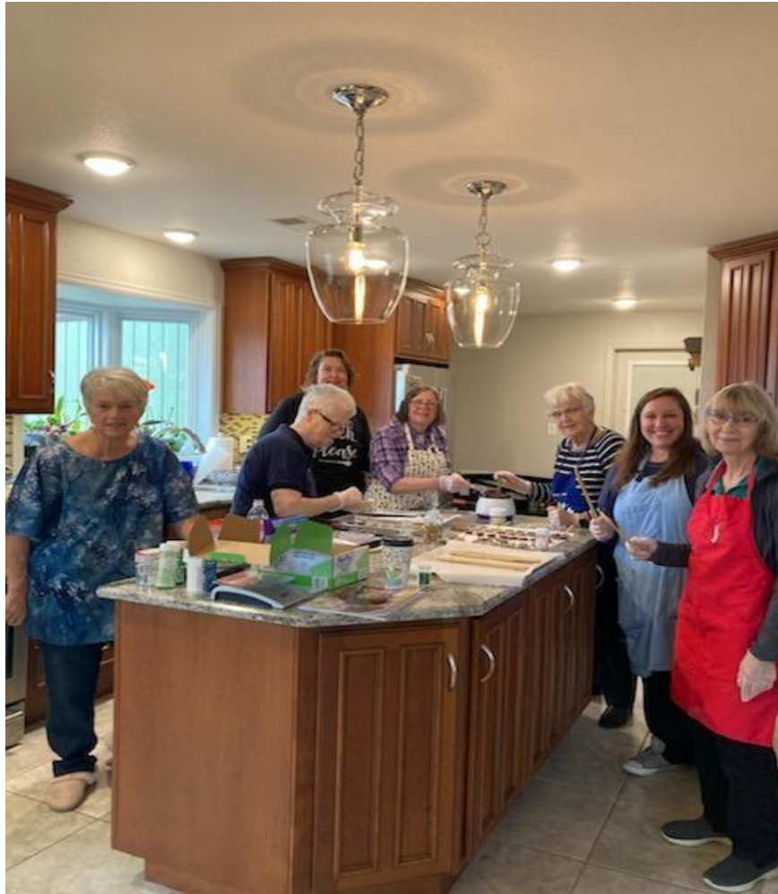
Christmas House Truffle Workshop