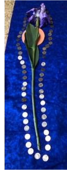
Picture 1: We ran out of dime holders! Picture 2: Don't forget to "pool" your resources. Picture 3: Oh my, money and flowers!