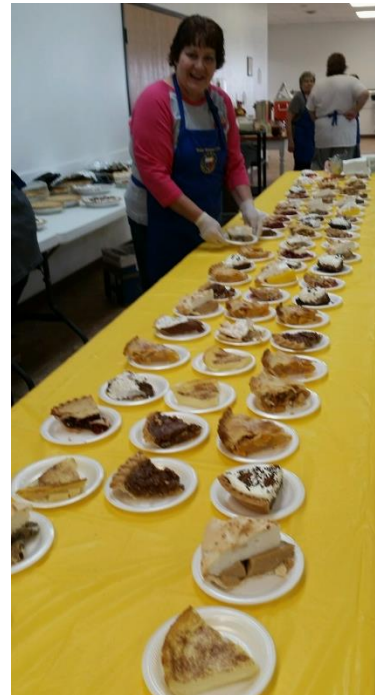
And, of course, there was pie...