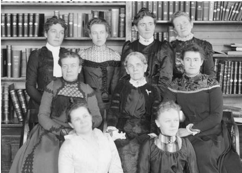
A few members of LWC in Jan 1907

Over the past 120 years, the members of this organization have worked continuously to improve the plight of others through charities and projects that are too numerous to count. This celebration of longevity is a testament to the dedication and determination of the women who have been and are members of this group. Many changes have occurred with world wars, economic hardships and political changes and yet the organization has not just survived but thrived. The Laramie Woman’s Club will continue to celebrate this anniversary throughout the year, as well they should.