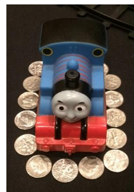
Picture 1: “It Takes Every Kind of People to Make the World Go Round” (Robert Palmer, 1978)