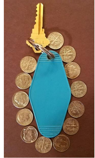
Picture 1: Our cup overflows with care for the moms and children in March of Dimes.